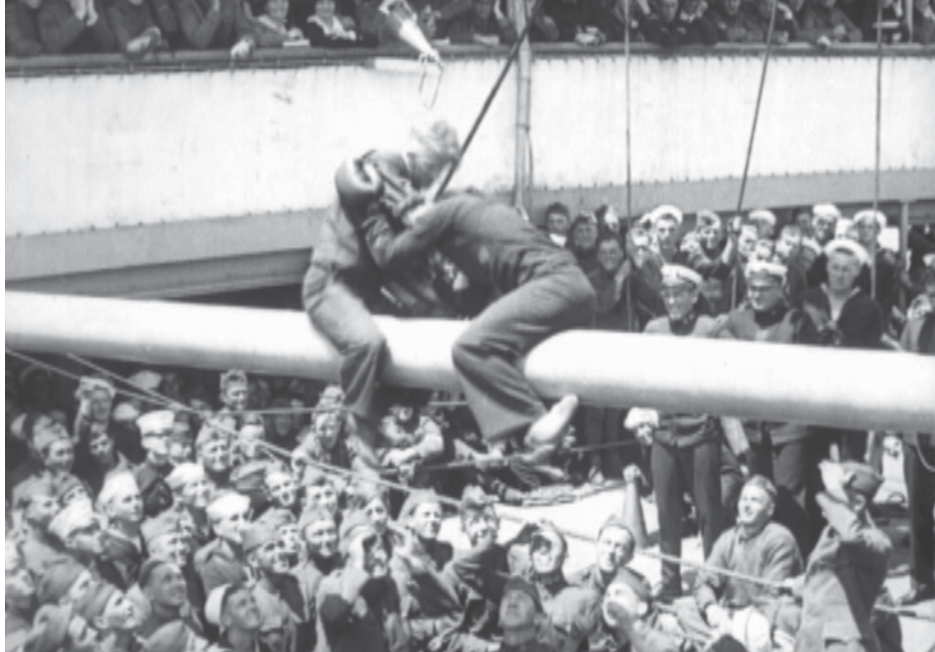
Above: A boxing competition is staged for President and Mrs. Wilson aboard the USS George Washington on July 8, 1919. Below: Training activities at Fort Lewis, Washington.