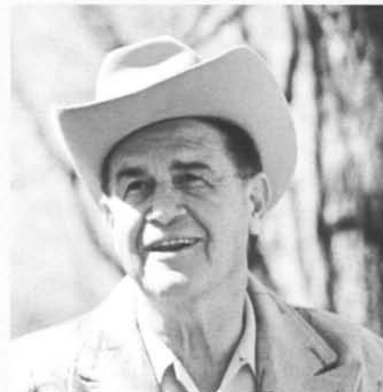
William Wayne Keeler, Principal Chief of the Cherokee Nation, 1949-1975. During this period, Keeler also rose to become Chairman of the Board and Chief Executive Officer of Phillips Petroleum Company.

The Cherokee Heritage Center, in cooperation with the Cherokee Nation, applied to the NHPRC for a grant to assist in the processing of these records. In hindsight, the scope of the grant was too ambitious. Several problems were inherent in this project: Various accession and catalog methods had been employed over the years; accession and catalog records were incomplete; photographs were removed without noting their original collection; and other records had no record of provenance. (continued on page 19)