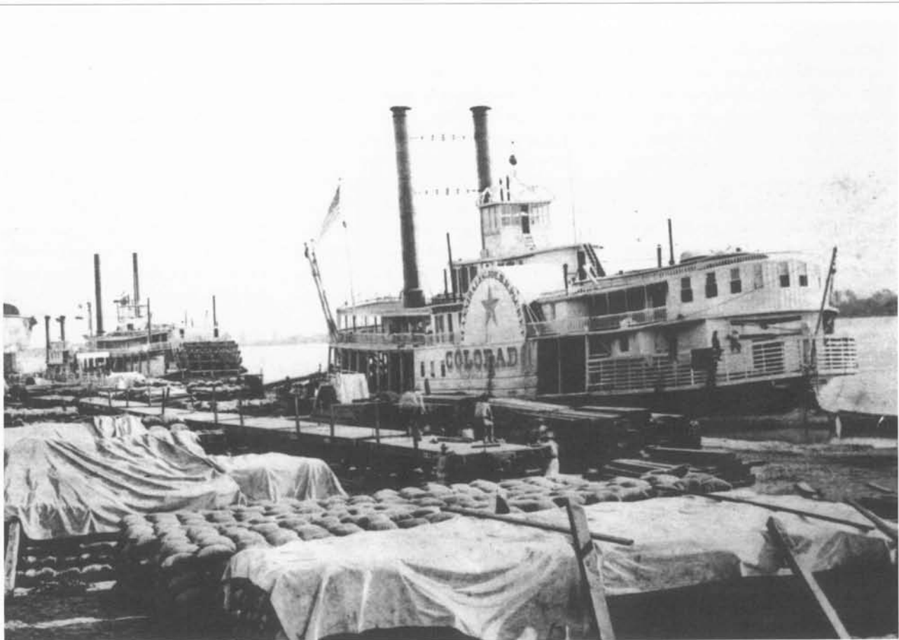
The steamboat Colorado was one of two such vessels used to transport the Miami Tribe from its ancestral homelands in Indiana to reserve lands in eastern and central Kansas. This forced migration, the result of an 1840 treaty signed at the forks of the Wabash River, began on October 6, 1846. At this point, the Miami Tribe became divided, since some tribal members were allowed to stay in Indiana. An article on the effect of an NHPRC records grant on the tribe's archives and records management program begins on page 8.

Visit us on the Web at www.nara.gov/nara/nhprc/ or e-mail us at nhprc@arch1.nara.gov