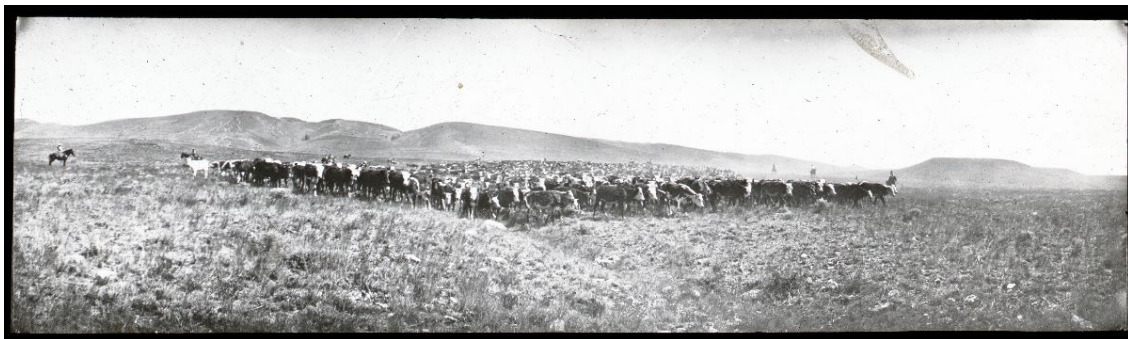
Photograph of Herd of Cows. National Archives Identifier 158884318

Search and explore more than 18,000 digitized historical photographs from the Bureau of Indian Affairs (BIA) records with the Bureau of Indian Affairs Photographs Finding Aid .