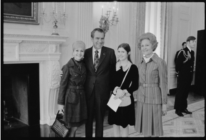
President Richard Nixon and First Lady Pat Nixon with Actresses Debbie Reynolds and Carrie Fisher, 2/10/1974

foreign travel, including Presidential vacations; social events and entertainment involving the First Family, including entertainers present. New highlights include: