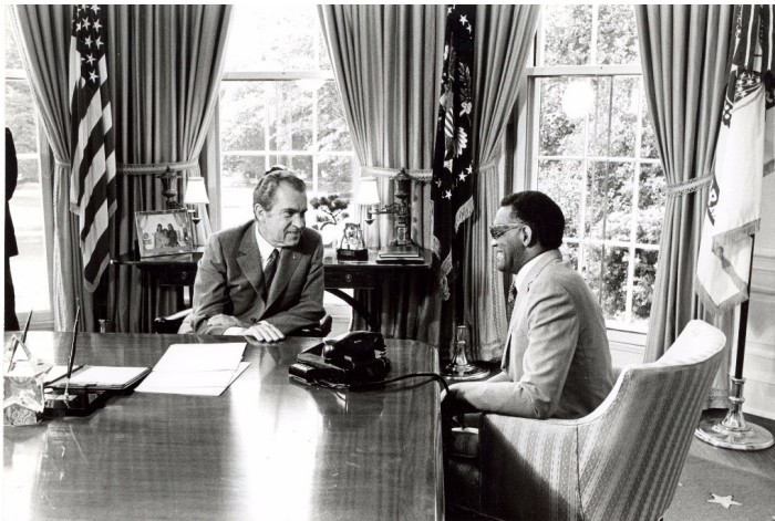
President Richard Nixon and Singer Ray Charles Meeting in the Oval Office, 9/15/1972