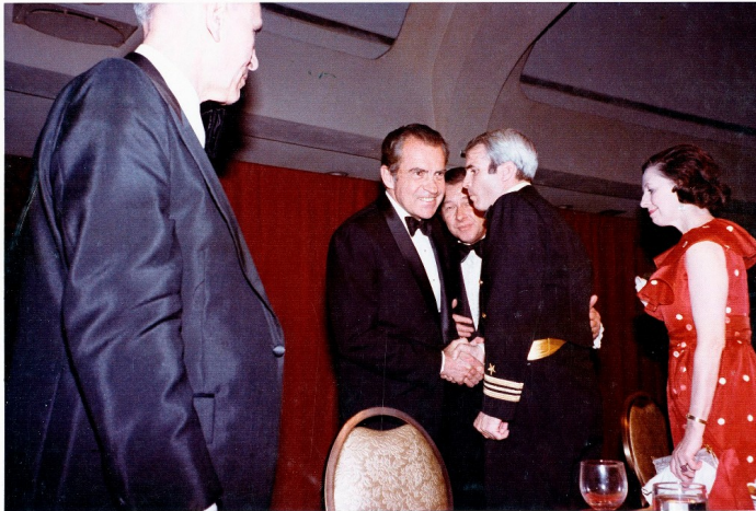
President Richard Nixon and U.S. Navy Lieutenant Commander John McCain at the 1973 White House Correspondents Dinner, 3/14/1973