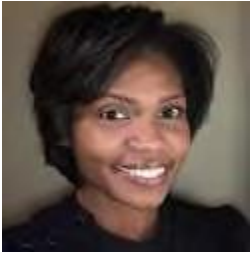
Chief Customer Experience Officer