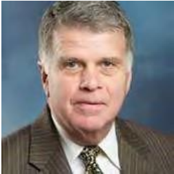
Archivist of the United States