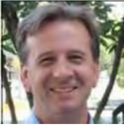
Director, Congressional Affairs