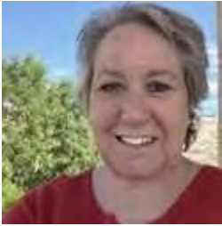
Acting Director, Office of Presidential Libraries