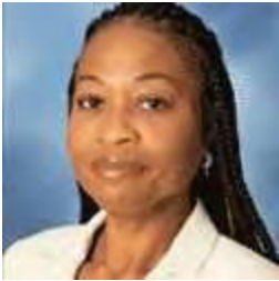
Chief Human Capital Officer

of Maryland in Accounting and Government and Politics.