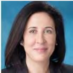
Deputy Archivist of the United States