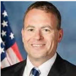
Director, Office of Federal Register