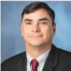
Director, Communications and Marketing