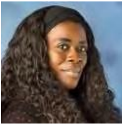
Chief Acquisition Officer