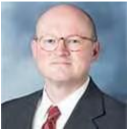
Director, National Declassification Center (NDC)