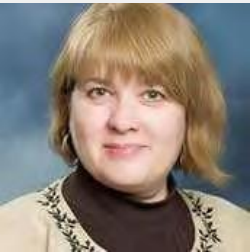
Chief Innovation Officer