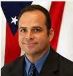
Executive for Agency Services