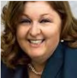
Director, Office of Government Information Services (OGIS)

He is a Phi Beta Kappa graduate of Washington & Lee University and holds an M.A. in Modern History from Oxford, which he attended as a Rhodes scholar, and a law degree from the University of Virginia.