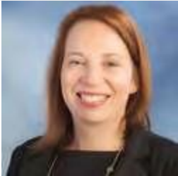
Chief Financial Officer