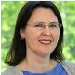
Director, Preservation Programs