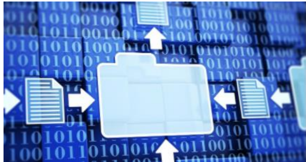
Machine Readable Docs