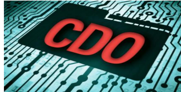
Chief Data Officer