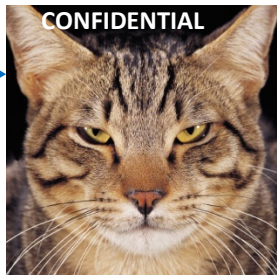
(U) Ferocious Cat

(U) Chart is classified SECRET, title of Chart is UNCLASSIFIED