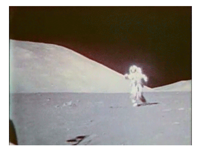
View more GIFs from our NASA holdings

In celebration of NASA's anniversary, we invite you to <u>explore our holdings</u> to discover the fascinating story of the creation of this agency and the story of space exploration.