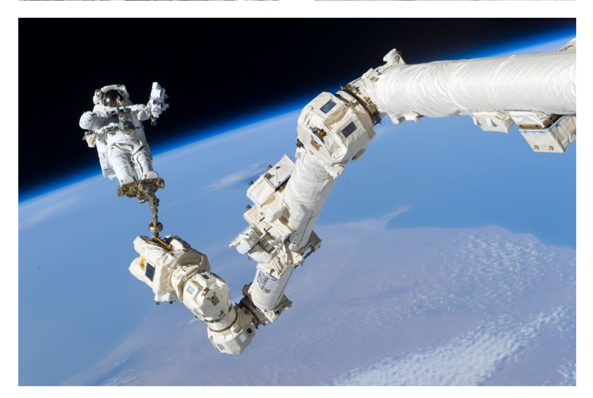
Explore NASA-related <u>lessons and activities</u> for the classroom, based on <u>primary sources</u> in the holdings of the National Archives.

You can help make the history of space exploration more accessible by participating in one