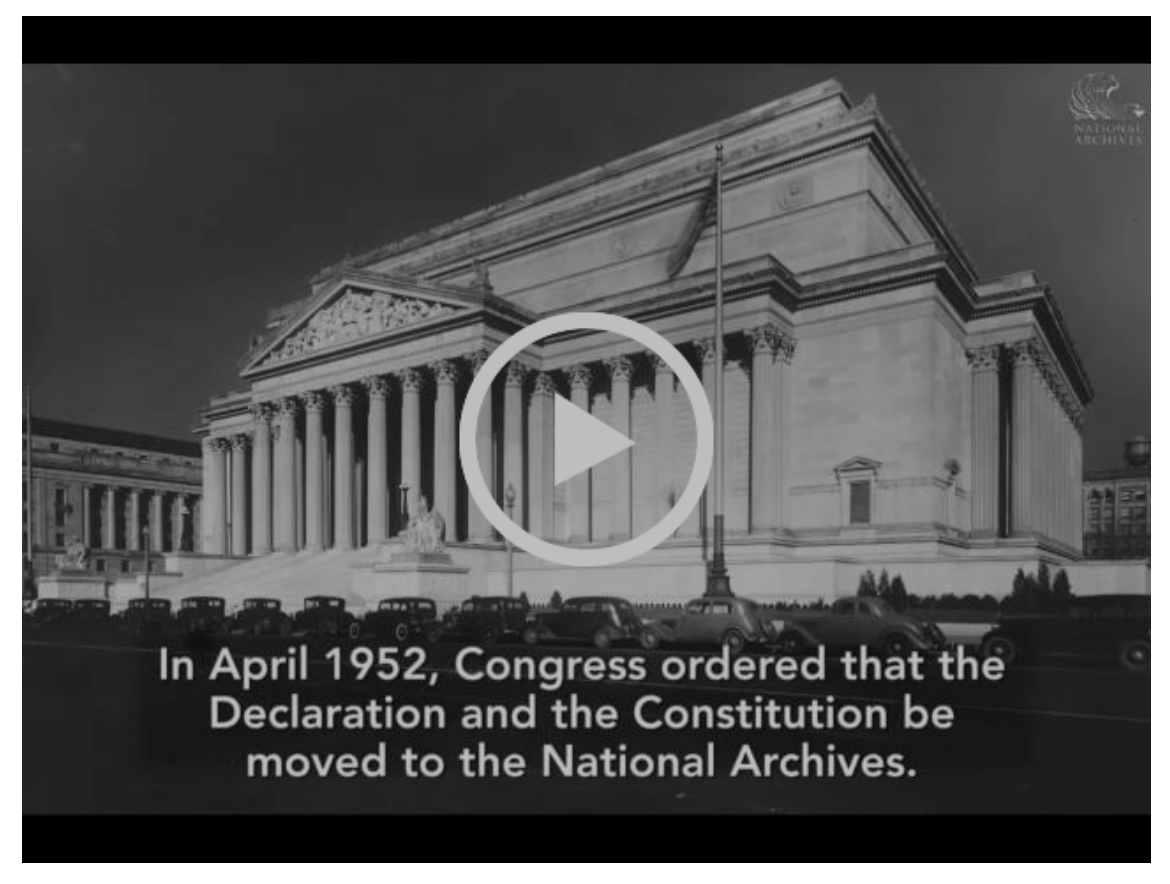
The U.S. Constitution found its permanent home at the National Archives in Washington, DC in 1952.