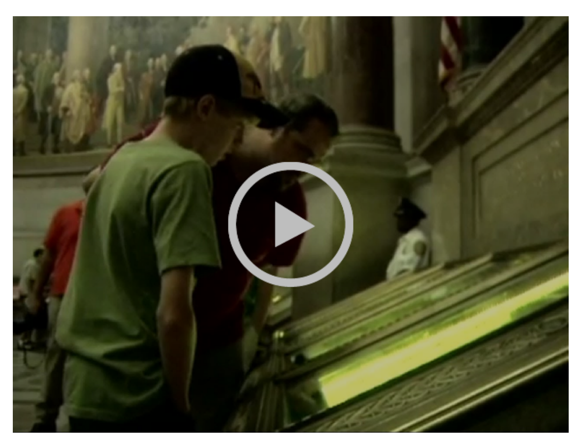
Go inside the vaults to learn more about the U.S. Constitution.