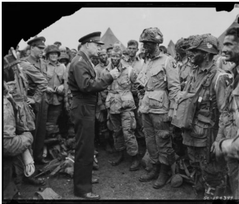
Photograph of General Dwight D. Eisenhower Giving the Order of the Day: "Full victory-nothing else" to paratroopers in England, just before they board their

We often say that the use of primary sources in the classroom brings history to life for students. Primary sources such as letters, photographs, posters, and speeches can provide a direct connection to historical events and an unfiltered view of the way people interacted with each other and responded to issues during a particular time period.