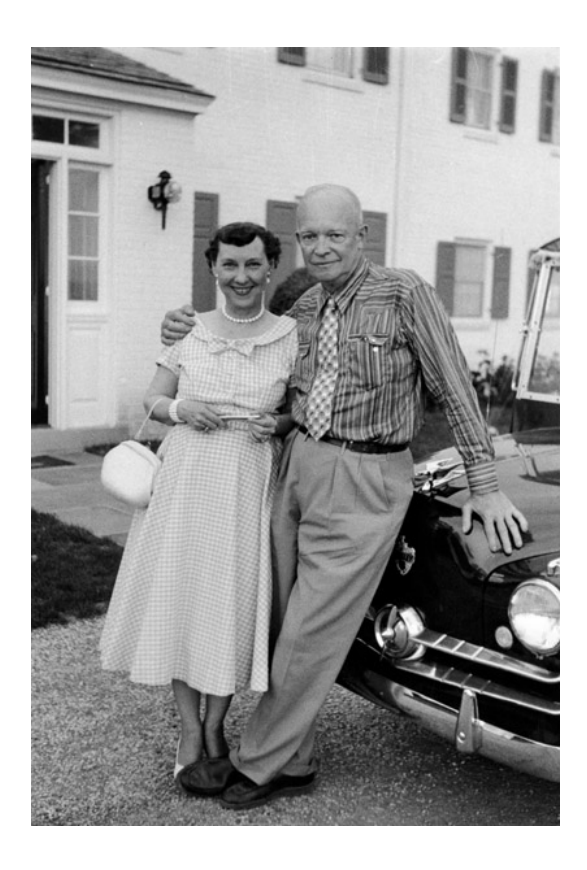
Left: Photograph of President William J. Clinton Jogging with South Korean President Kim Youngsam in Seoul, South Korea, 7/11/1993: <u>National Archives Identifier 2825175</u> Right: Photograph of Dwight and Mamie Eisenhower: <u>National Archives Identifier 594342</u>

To share more of the incredible resources held at the Presidential Libraries, our <u>virtual</u> <u>road trip</u> will make a "stop" each day at a different Presidential Library. We'll share records from each Library and feature a new citizen archivist mission using records from that location. Imagine what you will learn and discover as you contribute.