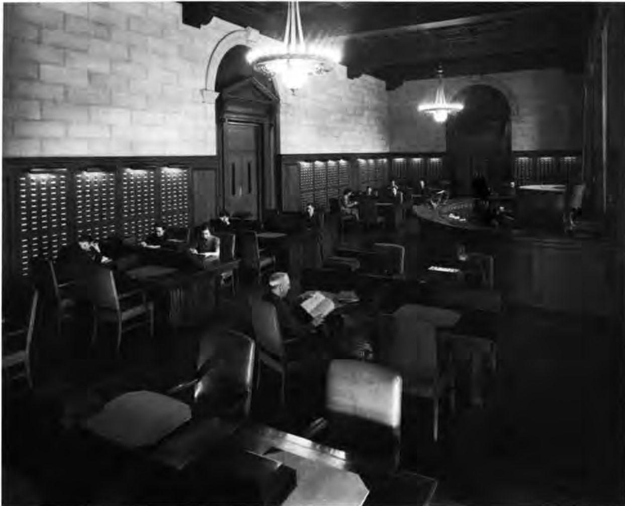
This is the central search room of the Archives as it appeared in April 1938.