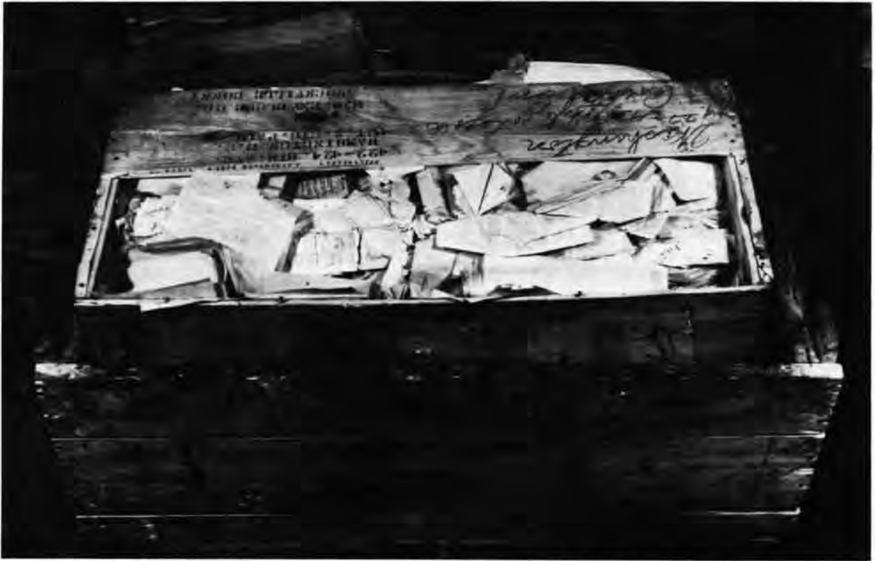
Records arrived at the National Archives in various states of disrepair and in all types of containers.