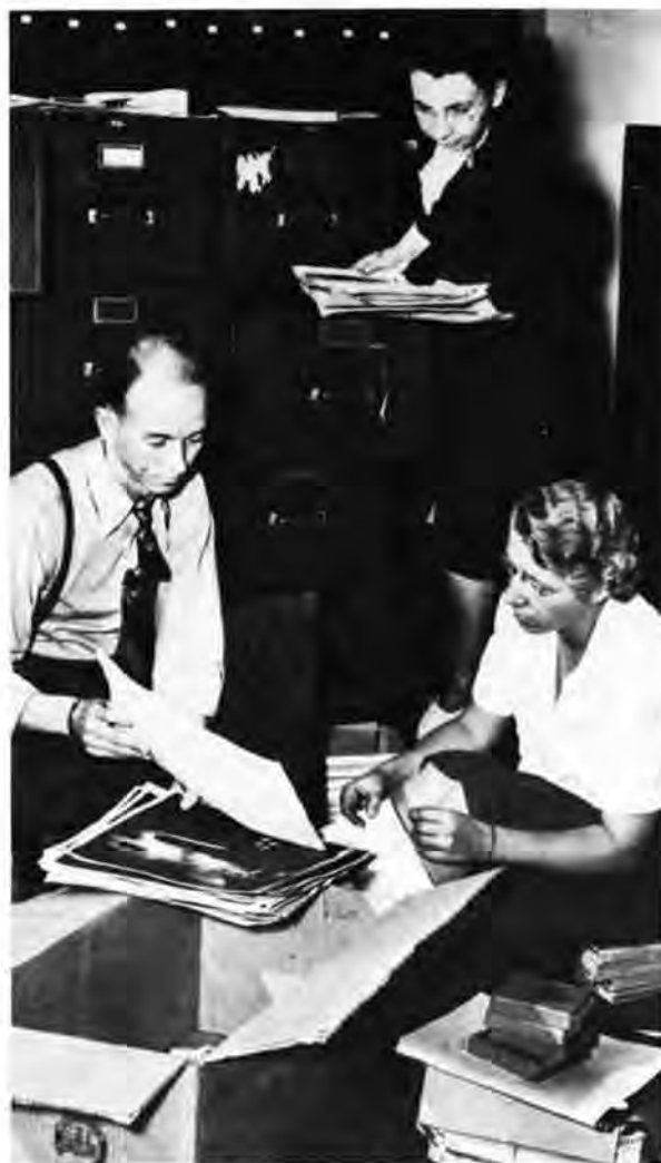
Archives staff members examine a new accession of photographs.

Precisely what would go into the National Archives had not been decided at the time of the agency's establishment. All that the authorizing