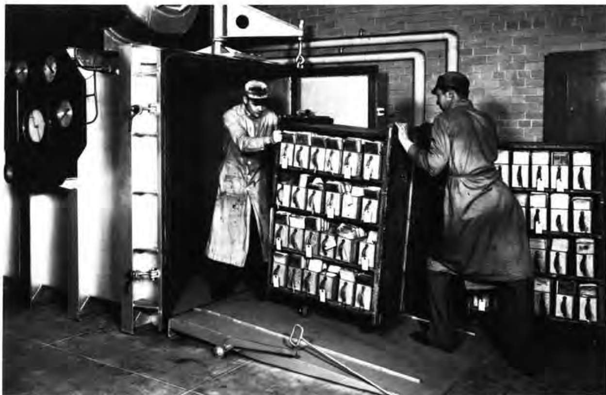
In this June 1936 photograph, employees of the Repair and Preservation Division wheel a cart of Veterans Administration files into a vacuum chamber for fumigation.

important factor was active support from their mentors in the historical profession, not the least of whom was the eminent American historian J. Franklin Jameson. In time staff members already on board were instrumental in bringing to the Archives their friends, fellow alumni, and former colleagues in the teaching profession, with alumni from the universities of Minnesota and Pennsylvania particularly well-represented. Once the National Archives began the process of taking into its facilities established archival collections which had been assembled and organized by the State Department, the Veterans Administration and others, many of the agency employees who previously had serviced these collections joined the Archives staff.