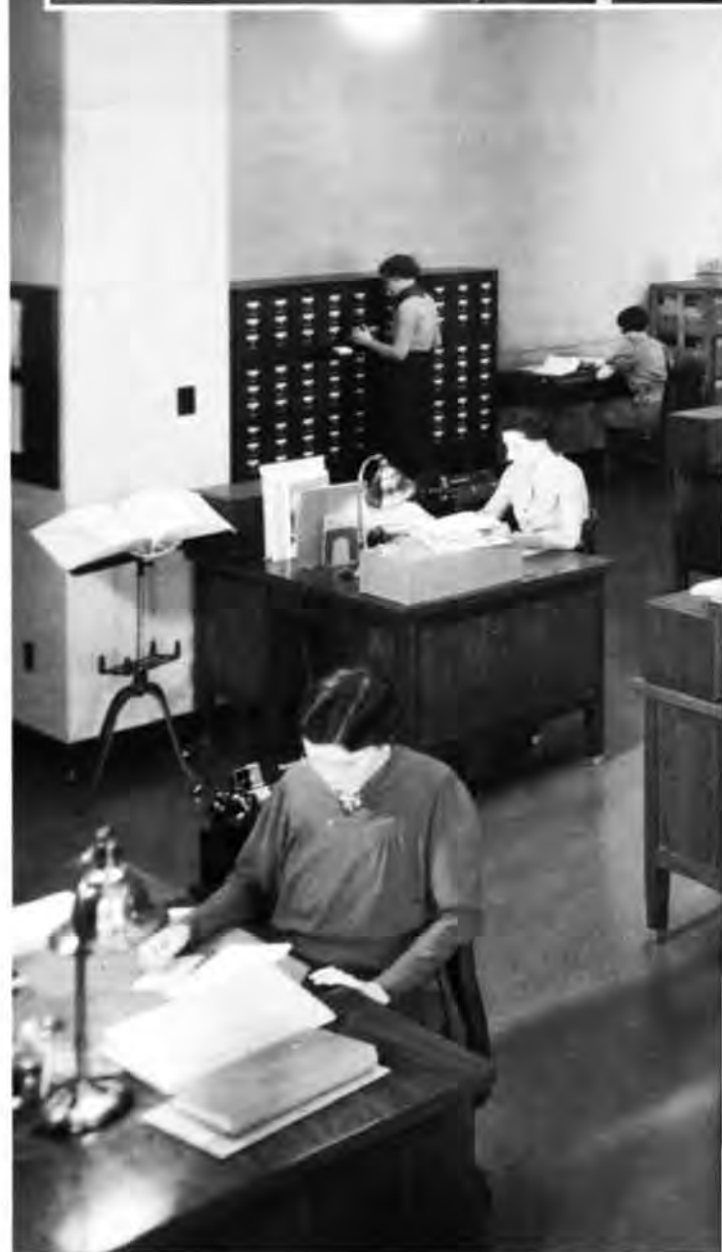
Archivists developed procedures for the preservation and