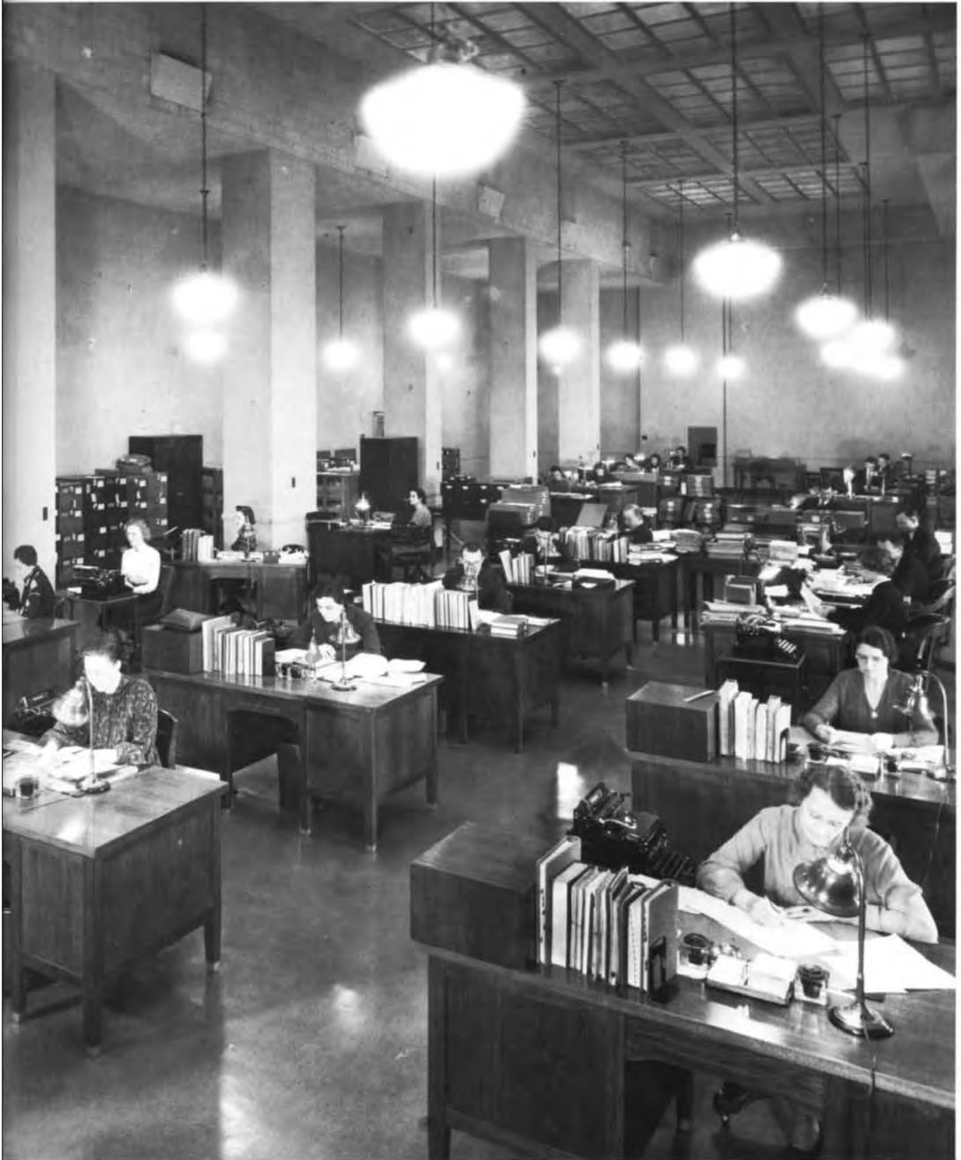
description of the newly accessioned archival materials in the late 1930s.