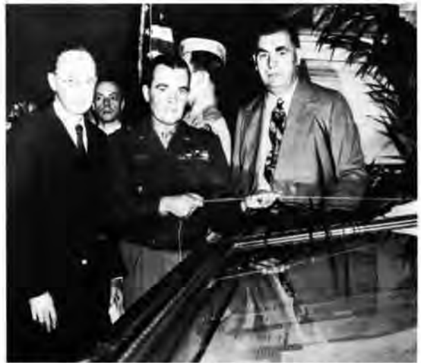
Major General Anthony C. McAuliffe, hero of the Battle of the Bulge, unveils an exhibit of German surrender documents. At left is Solon Buck.

Since during the war authorization for staff levels was based on how valuable the agency was to the war effort, the Archives did its best to prove its usefulness. The National Archives did in fact make significant contributions to the war effort in many ways. The Archives gave priority to processing the records of World War I agencies so that their World War II successors might learn how similar problems had been resolved. (The standing joke at the Archives was that the purpose of this work was so that the