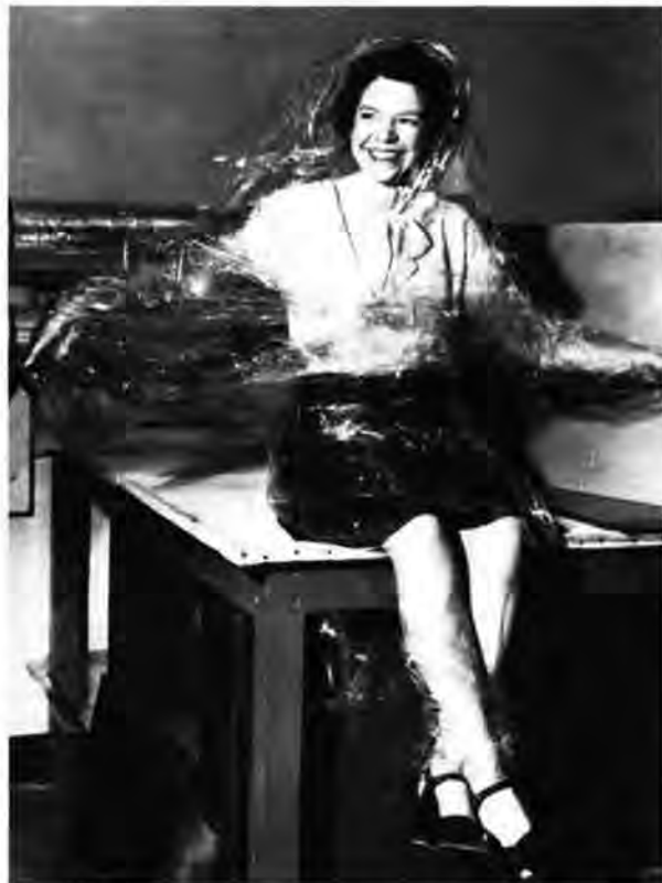
An Archives staff member shows off the cellulose acetate used for the lamination of documents.