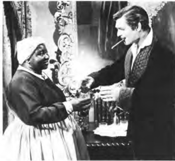
Hattie McDaniel and Clark Gable in Gone With The Wind .

What the Archives had defined as its top priorities for records acquisition and what it first brought into the new building were two different things. The Food Administration records, for instance, were not intrinsically of great value, especially since the most important of the papers relating to the agency had already been accessioned by the Hoover Institution in California. Yet the Archives not only took in those Food Administration records in storage in the Washington area (most of which concerned local ac-