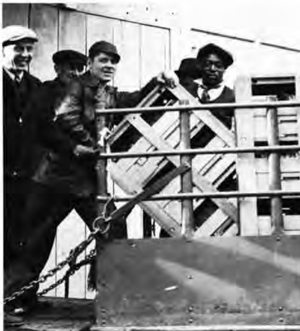
The records of the U.S. Food Administration arrived at the Archives in December 1935.

archival work at the National Archives was to be carried out by professional divisions: Accessions (surveying and appraising likely material for inclusion in the National Archives); Repair and Preservation; Classification (determining a numbering system for records brought into the National Archives); Cataloging (developing a general catalog of the Archives' holdings); Reference; Research (including the creation of cross-sectional and interdisciplinary guides to the Archives' collections); Maps and Charts; Motion Pictures and Sound Recordings; and the Library (setting up and maintaining a reference library for the staff and researchers at the National Archives). Almost as an afterthought Hyde indicated that records transferred to the National Archives were to be maintained by multiple custodial divisions that would reflect the organizational make-up of the federal government. For instance, the State Department Archives would maintain the records of the Department of State.