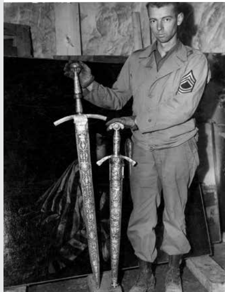
This Prussian crown was part of a collection of coronation paraphernalia found at Bernterode. Below: Two finely wrought swords of Frederick the Great.

were repacked and deposited in the bank. The boxes contained, among other objects, the Prussian coronation paraphernalia.