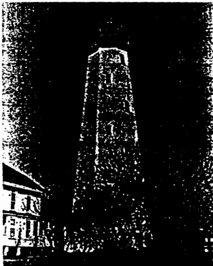
SANDY HOOK LIGHTHOUSE

No matter who owned the lighthouse, the early lighthouse keepers had to maintain the light every night all year long in all kinds of weather. The original light was probably provided by copper whale oil lanterns, each holding a number of wicks. The oil had to be carefully carried up the stairs to fill the lamps. Other types of lighting apparatus and illuminants were used until 1856-57, when the lighthouse was fitted with a third order Fresnel lens. The glass prisms of a Fresnel lens concentrated the light of the lamp in its center to produce a very bright, narrow beam. A few years later the inside of the tower was lined with brick, and an iron spiral staircase was added. Few structural changes were made to the exterior of the lighthouse tower over the past two hundred years.