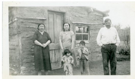
L: Camp Building- Mt. Goseping L.O.